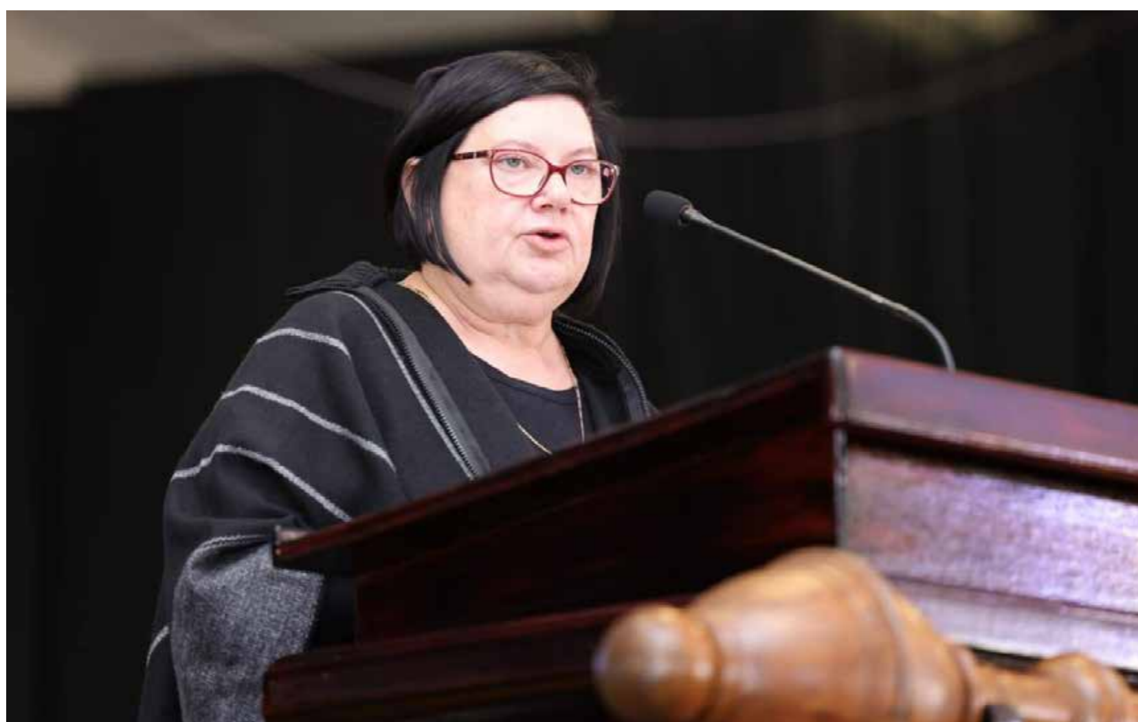
Free State MEC for Agriculture, Elzabe Rockman, pins economic hopes on environmental turnaround.