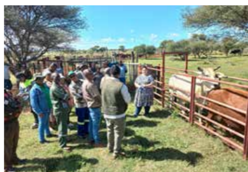
Beef and mutton farmers fostering Livestock Value Chain through training.