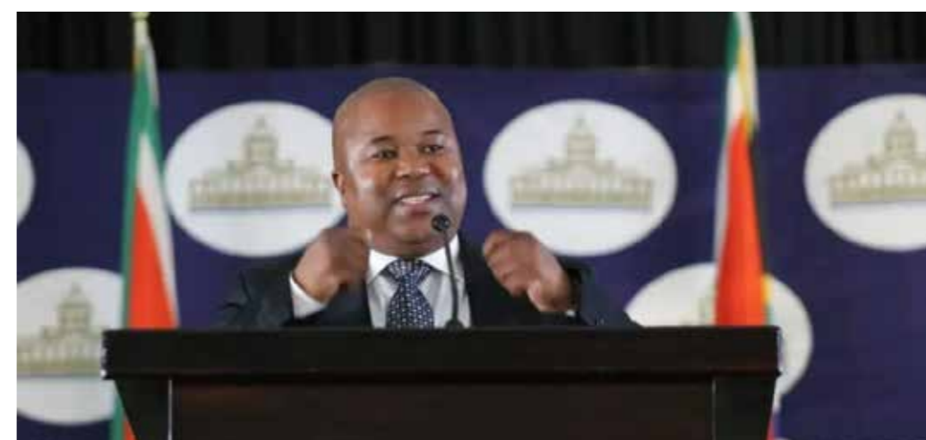
Human Settlements MEC Saki Mokoena