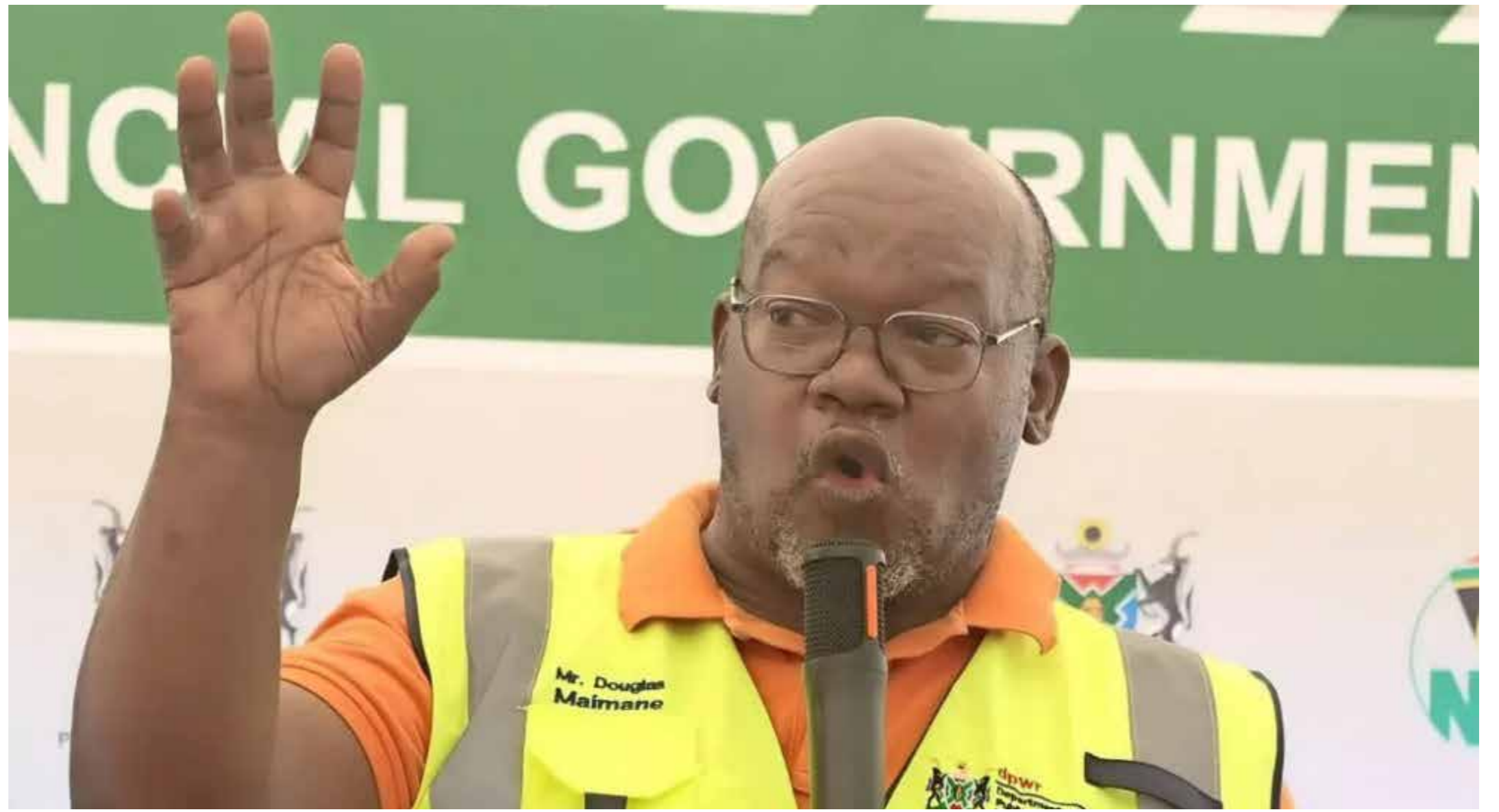
Fired Madibeng Local Municipality Mayor, Douglas Maimane.