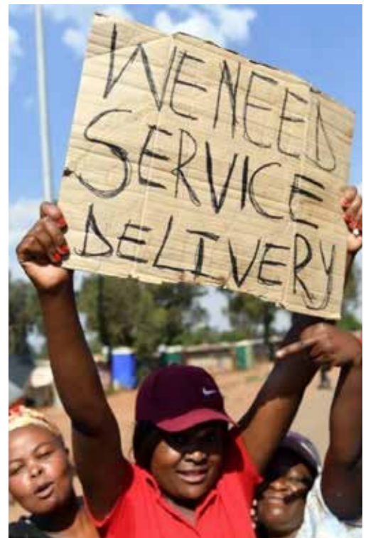
Several municipalities in the Free State and the North West could face imminent collapse due to service delivery failures

"This is not new. The Auditor-General has consistently highlighted the dire state of municipalities, particularly in the Free State and North West. The problem is that there are no tangible consequences."