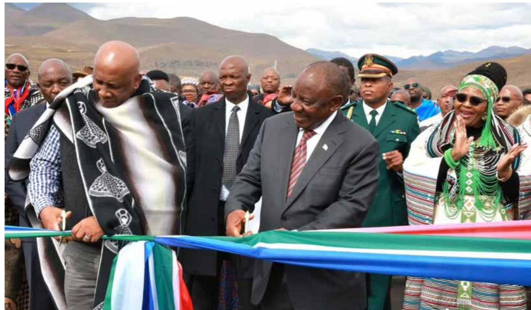
King Letsie III and President Cyril Ramaphosa cutting the Senqu Bridge ribbon.

The historic structure is part of the Lesotho Highlands Water Project that has already created thousands of jobs