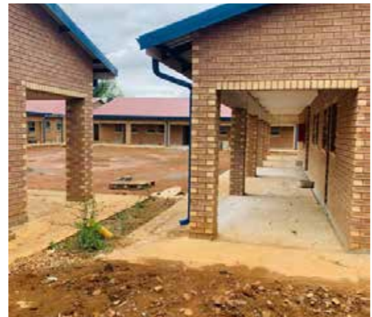
services can operate so freely around our schools," he said. "The national focus is on improving service de-