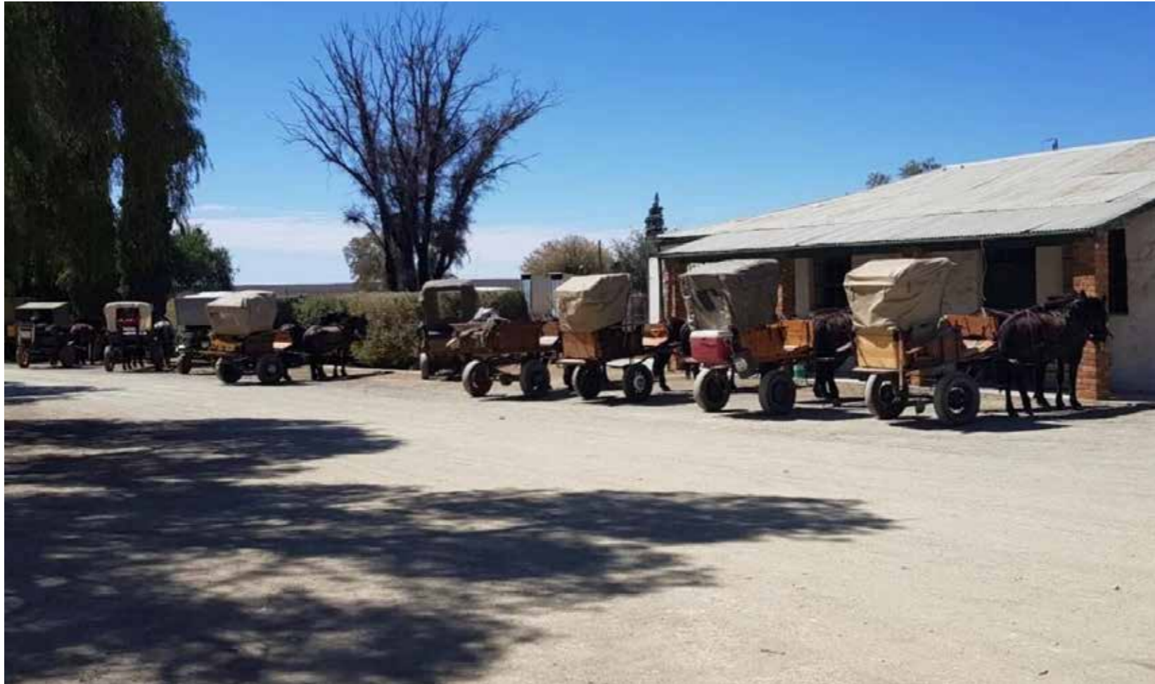
Middelpos Town goes on auction on 21 May 2026