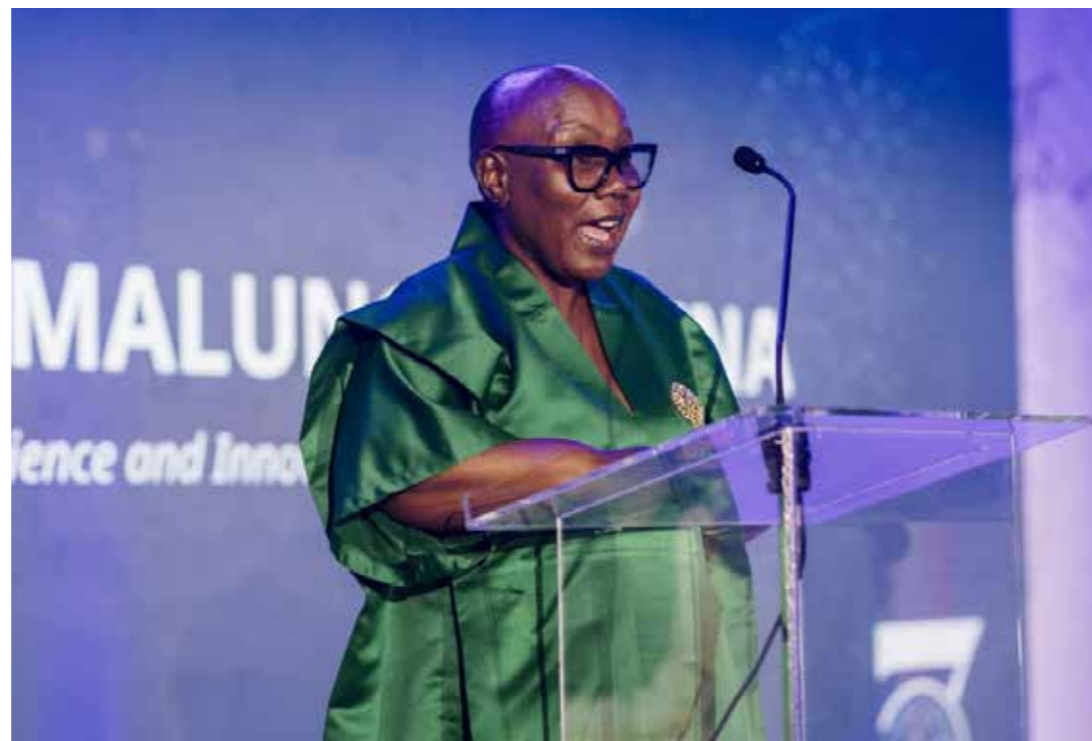
Minister of Science, Technology and Innovation, Dr Nomalungelo Gina, is ready for women to spearhead science.