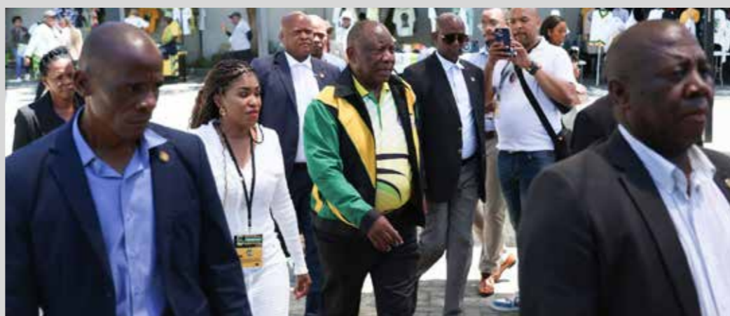
President Cyril Ramaphosa arrives at the 5th National General Council of the African National Congress held at Birchwood Hotel in Boksburg on 08 December 2025.

"The ANC can no longer command support; it