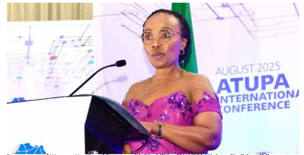
Department of Women, Youth and Persons with Disabilities (DWYPD) Minister Sindiwe Chikunga.

"Beyond your discoveries, it is your determination, passion, and commitment to passing on knowledge that drives us," she said.