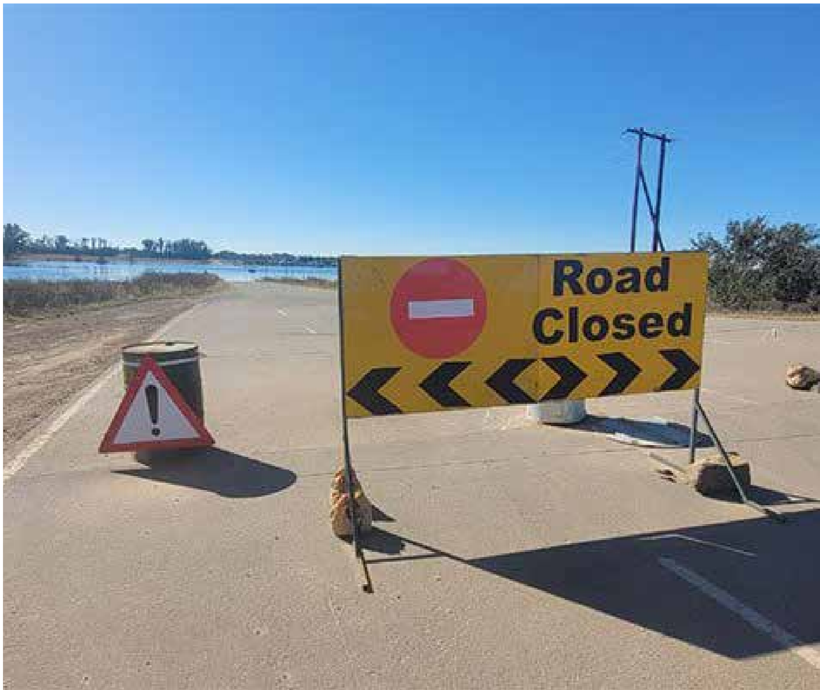
A 200m stretch of the R59 bypassing Viljoenskroon was flooded three years ago but has yet to be fixed.

Road construction projects in the Free State are grinding to a halt as political ideologies dominate procurement processes