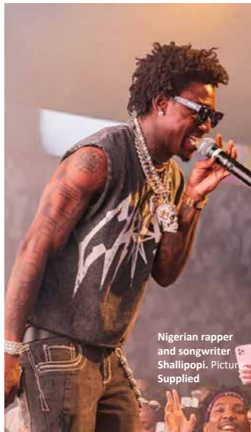
Nigerian rapper and songwriter Shallipopi.

Pretoria's self-taught cook, @malumfoodie,