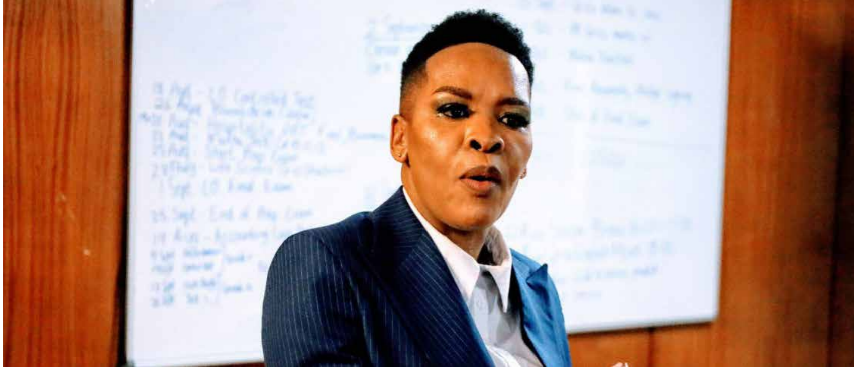
North West Department of Education MEC Ntsetsao Motsumi.