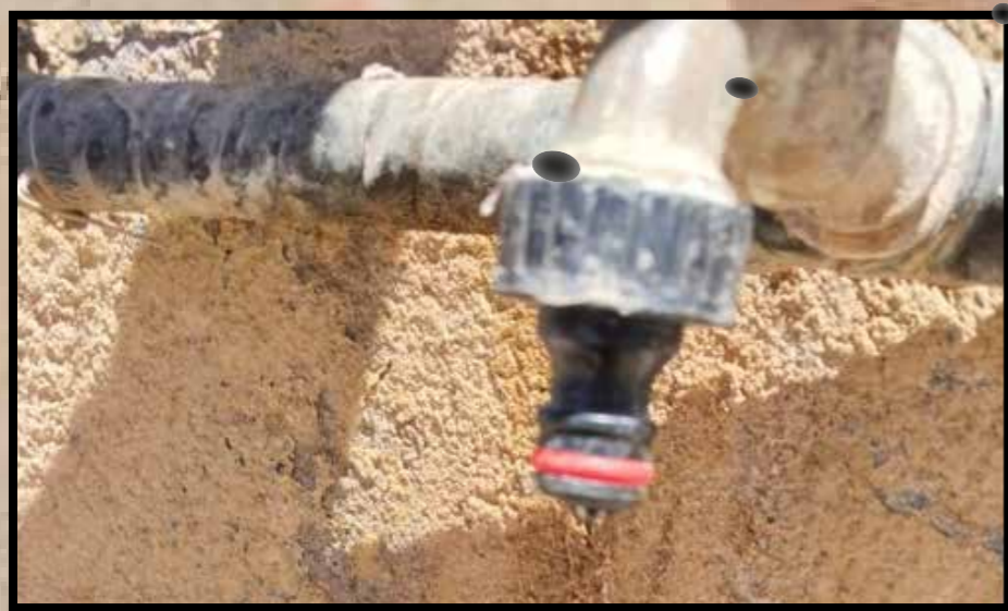
Montana resident Noreen Makamel has been without water since September.

Months without water, soaring bills and failing infrastructure leave residents desperate and demanding answers