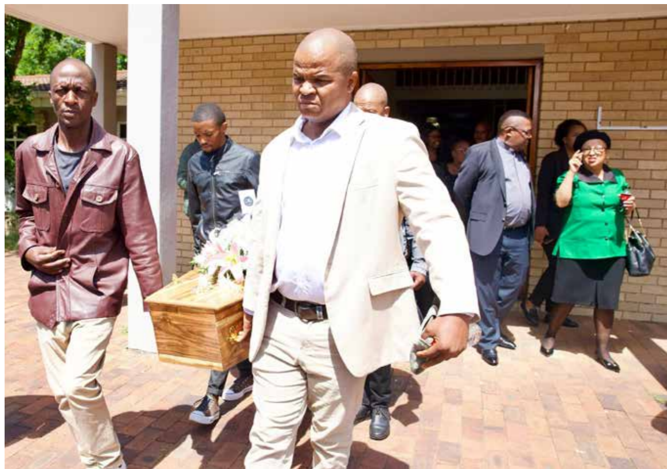
Murdered Toddler Laid To Rest.