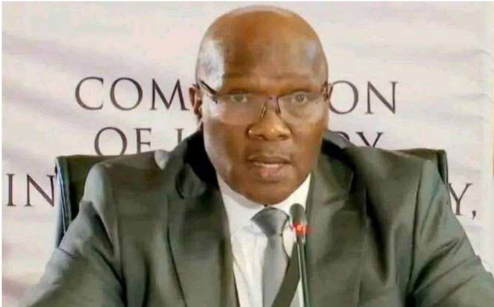
Crime Intelligence boss, Dumisani Khumalo, testifying at the ongoing Madlaga Commission.

The country's top spy, Lieutenant General Dumisani Khumalo, and six other police officers on Thursday returned to the Pretoria Magistrate's Court, on charges of fraud and corruption — a case that has reignited controversy surrounding the widespread allegations of corruption and infiltration within the South African Police Service (SAPS) ranks.