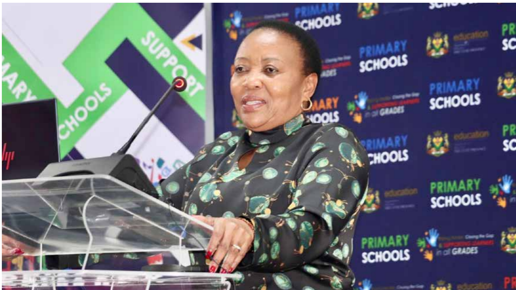
Free State is reorganizing its post-matric intervention approach from the Finishing Schools Model to the Second Chance Matric Support Programme.