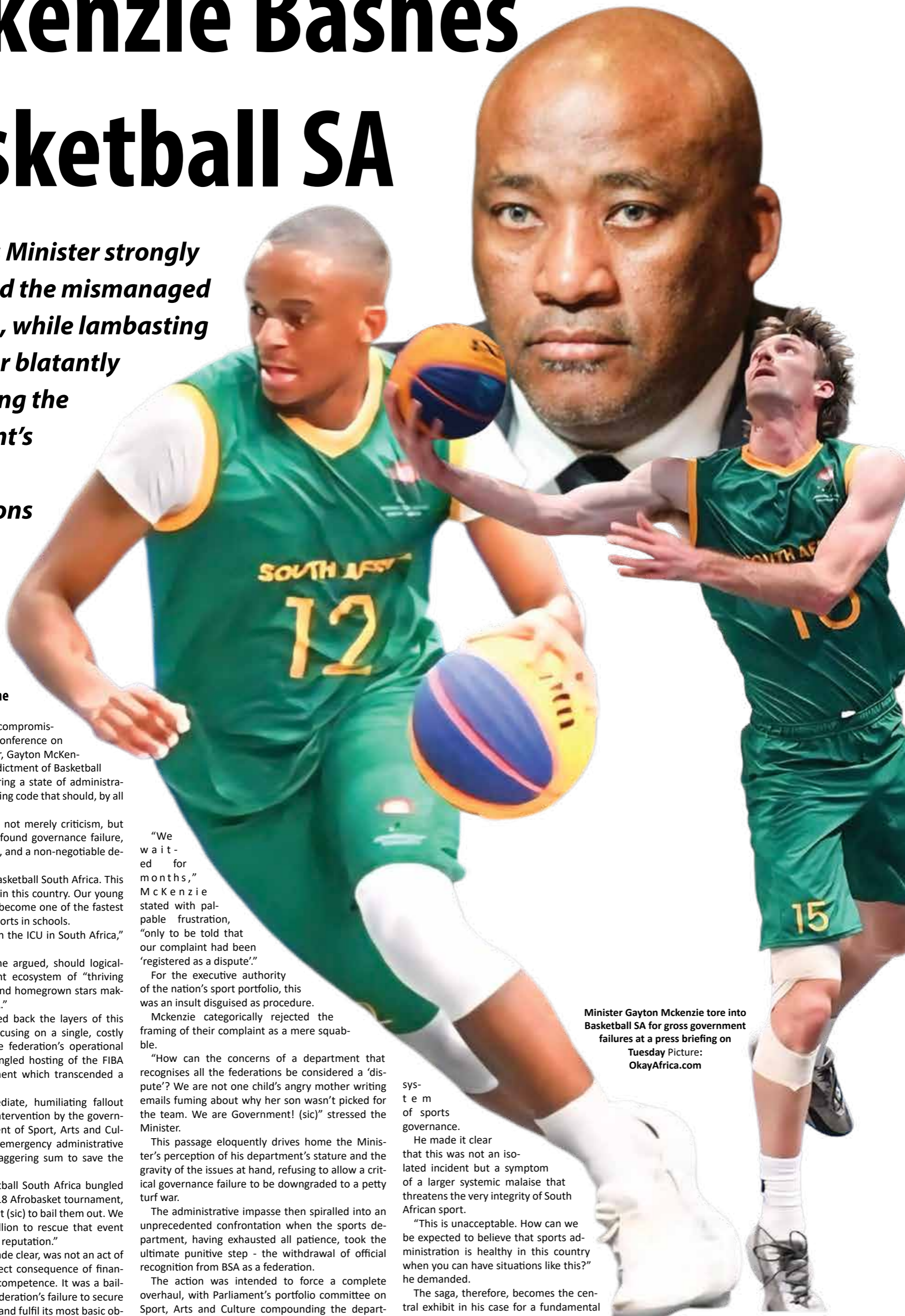
Minister Gayton Mckenzie tore into Basketball SA for gross government failures at a press briefing on Tuesday.

As blunt as it may have seemed, Mckenzie's scathing BSA rant also served as a forceful manifesto for transparency, good governance, and the protection of public funds in a sector where the nation's youth and reputation are the ultimate stakes.