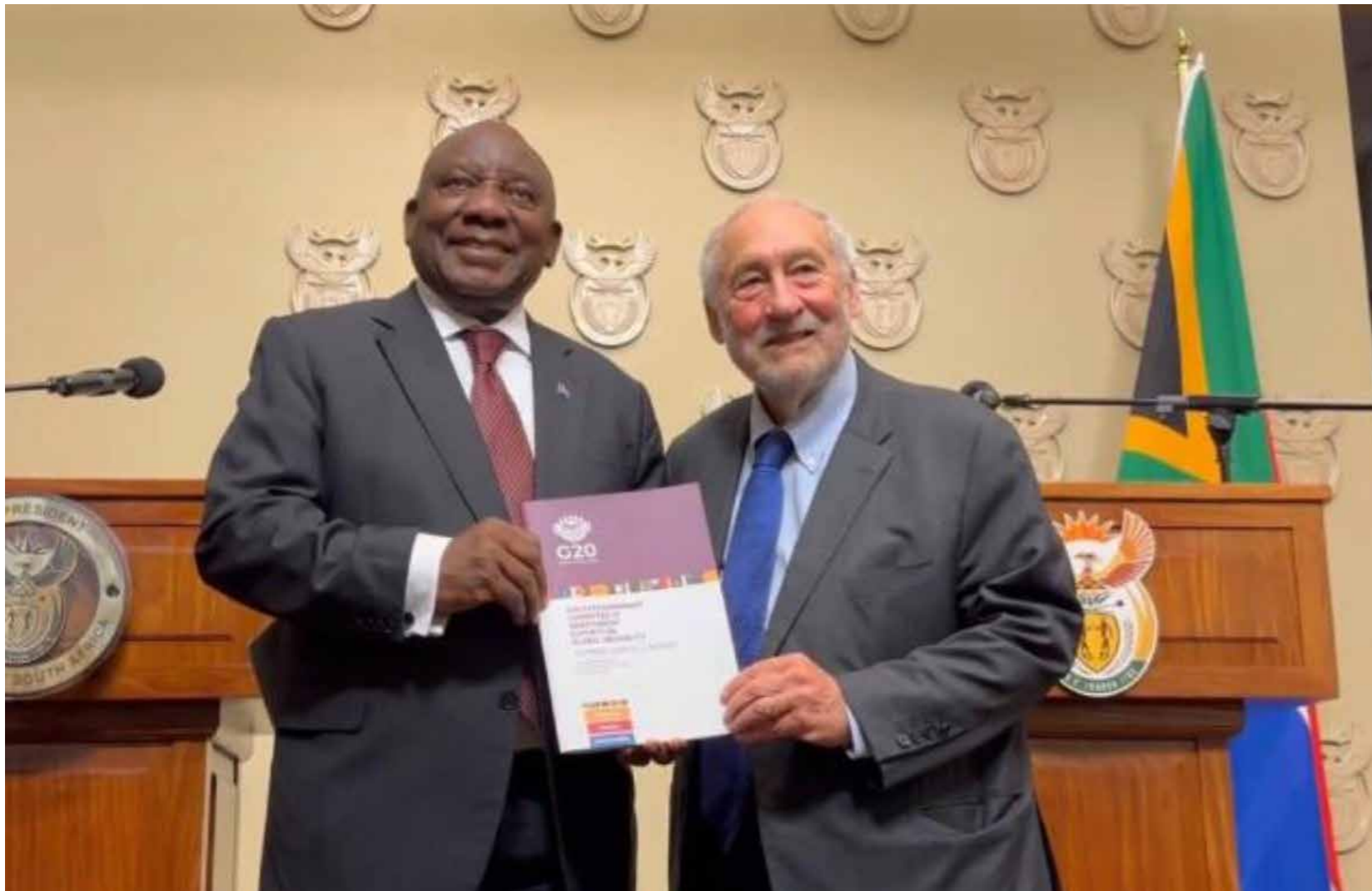
President Cyril Ramaphosa Nobel Prize-winning economist Professor Joseph Stiglitz during the handover of the report by the G20 Extraordinary Committee of Independent Experts on Global Inequality at Tuynhuys.

President Cyril Ramaphosa has reaffirmed South Africa's commitment to placing the fight against global inequality at the centre of the upcoming G20 Leaders' Summit to be held in Johannesburg later this month.