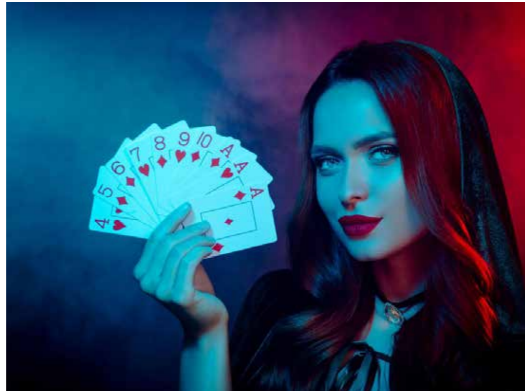
South Africa dealing with a gambling crisis.

"If I had a choice, I'd quit and focus on my job, but I don't earn enough. Gambling feels like my only op-