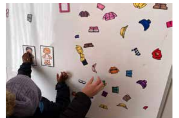
Kids playing with drawings.

Department targets underutilised schools for conversion to meet autism support needs