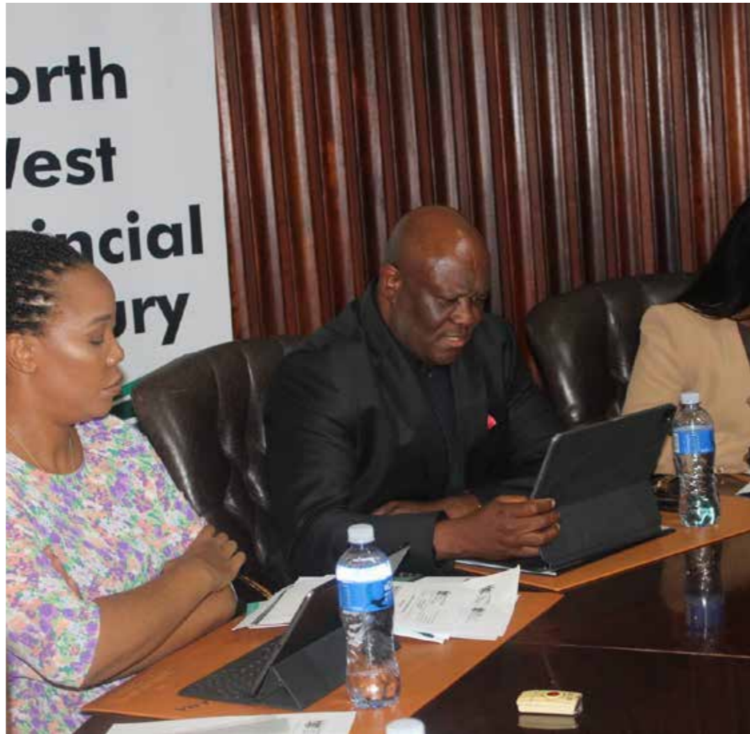
CoGTA and Treasury Intervene to Rescue Matlosana’s Finances.