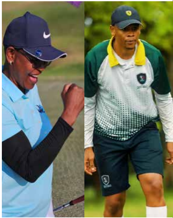
By Lerato Mutlanyane

In South Africa's sports landscape, long dominated by rugby, cricket and football, a quiet revolution is gaining ground. FootGolf — a hybrid sport combining football and golf — is steadily attracting attention, with local athletes pushing it into the spotlight.