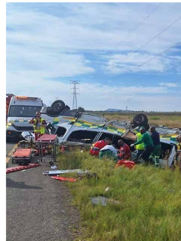
One person died in a collision on the N8 near Mandela View.

One person has died following a collision between a Free State Department of Health patient vehicle and a light motor vehicle along the N8 near Mandela View.