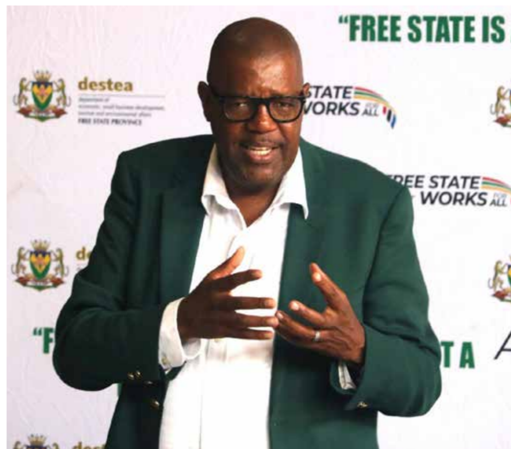
DEDT MEC Ketso Makume