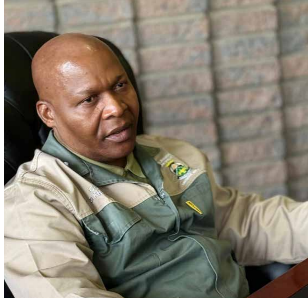
Matjhabeng Local Municipality Executive Mayor Thanduxolo Khalipha.

International youth federation partnership targets investment, skills development and job creation in key sectors