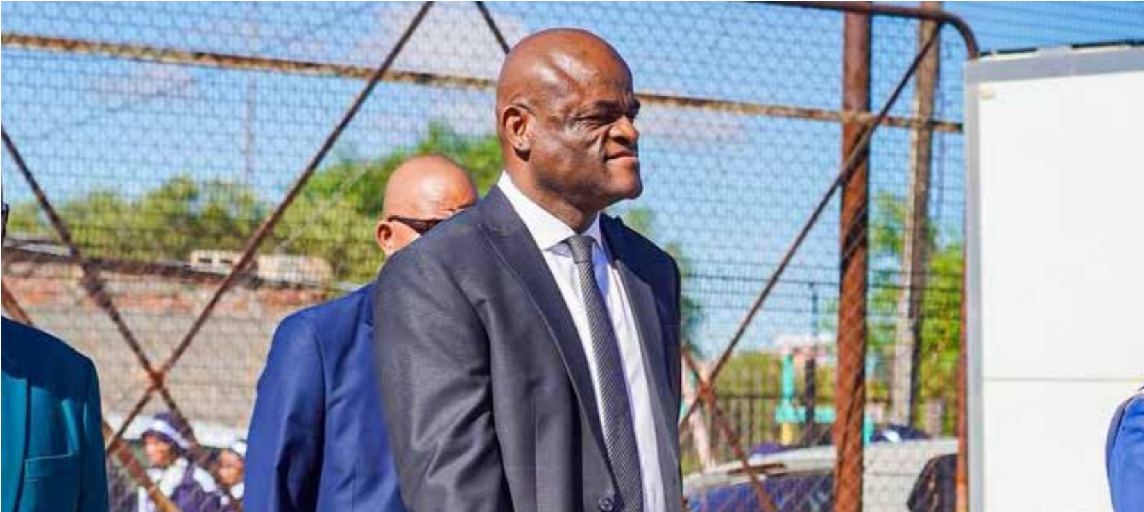
Northern Cape Premier Zamani Saul.

Inaugural Investment and Jobs Summit in Kimberley to unlock mining, green energy, agriculture, and infrastructure opportunities, driving growth and sustainable employment across the province